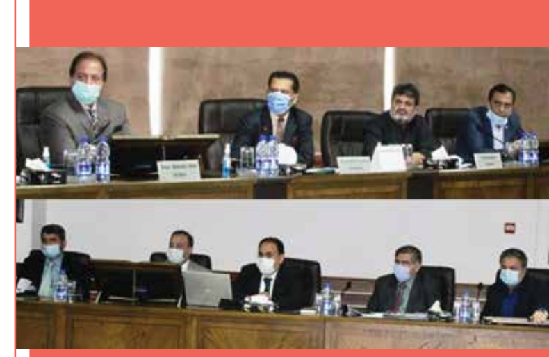
Public Hearing on the petition filed by WAPDA Hydroelectric for revision of Tariff for the FY2020-21 for supply of power from WAPDA Hydropower Stations held on November 12, 2020